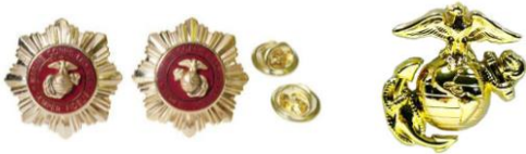
Regular Member – Short Sleeve Collar Ornaments & MCL Cover Gold Enlisted EGA