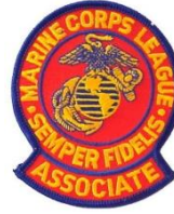
Left Sleeve Patch