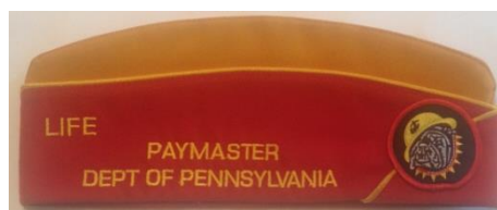
Shown with MODD patch ↑↑