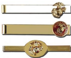
All three Tie Bars are authorized for wear