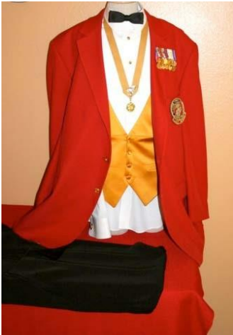
RED BLAZER FORMAL