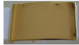
(Assoc. Member - Plain)