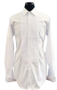
Tuxedo Shirt White Flat Collar, Pleated Front