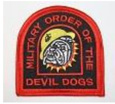
American Flag OR MODD Patch – Right Sleeve (Wearers Choice)