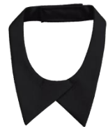
Black Female Neck tab