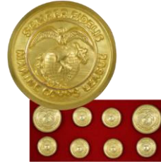
Red Blazer buttons – large & small