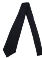
Black Tie, Plain