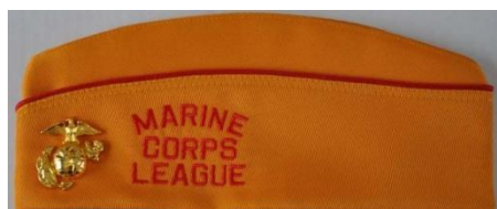
National Officer Cover or MODD Kennel Officer Cover