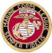
Red Blazer Crests