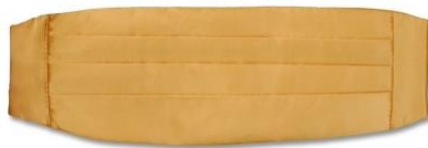
Female Gold Cummerbund