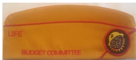
Shown with MODD patch ↑↑

When Marine Corps League Members are wearing the appropriate cover, they are considered to be in uniform. NO OTHER TYPE OF COVER MAY BE WORN AT A MARINE CORPS LEAGUE FUNCTION OR MEETING. We are seeing more MCL members with pins and devices of all kinds on their covers. If you got them on your cover, you need to remove them. They DO NOT belong on the cover.