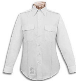
White Long Sleeve Aviator Style