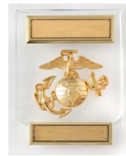
Red Blazer Custom Pocket Inserts (MARINEcrest.com)