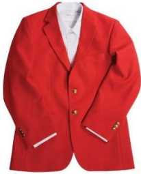
Red Blazer – Male