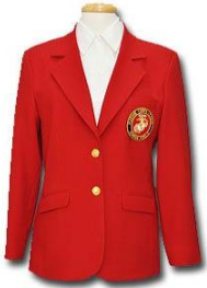
Red Blazer – Female