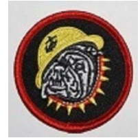
MODD Cover Patch