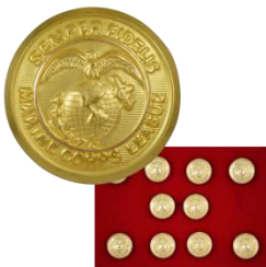
MCL Evening Dress Mess Button Set