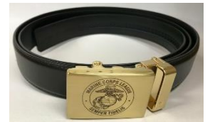
Black Leather Belt (All are authorized for wear)