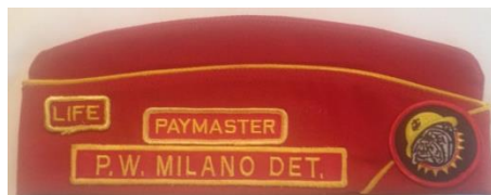
Shown with MODD patch ↑↑

↑↑ Standard Cover worn by ALL members of the MCL ↑↑