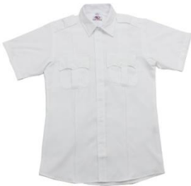
White Short Sleeve Aviator Style