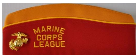
Department Officer Cover or MODD Pack Officer Cover