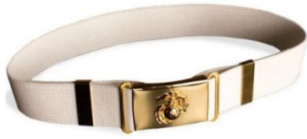
White Web Belt with NCO Buckle (Regular Member) (ONLY to be worn when performing the duties of Sgt-at-Arms, Color Guard, Honor Guard)