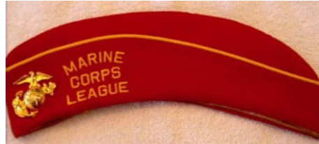
Regular Member – FEMALE