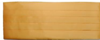
Male Gold Cummerbund