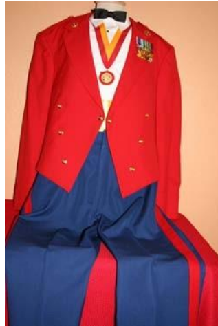
EVENING DRESS JACKET DRESS BLUE TROUSERS WITH RED NCO STRIPE