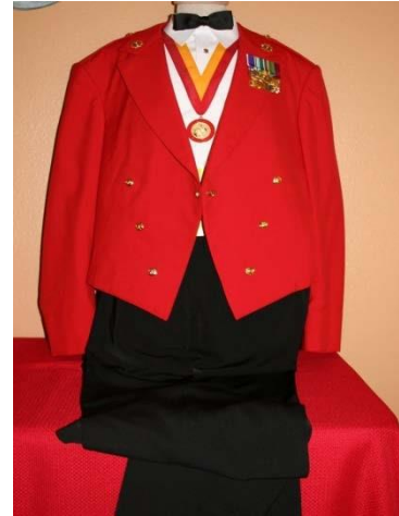
EVENING DRESS JACKET BLACK TUXEDO TROUSERS OR BLACK TROUSERS WITH BLACK LEATHER DRESS BELT