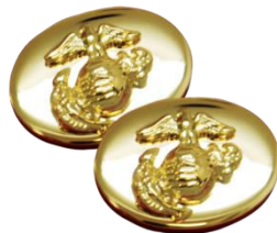
Cuff Links Gold