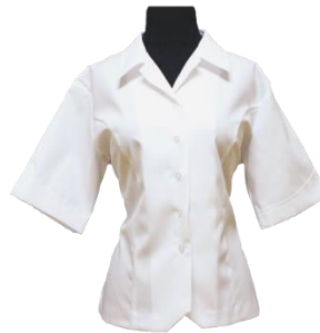
Women's White USMC Style Short Sleeve