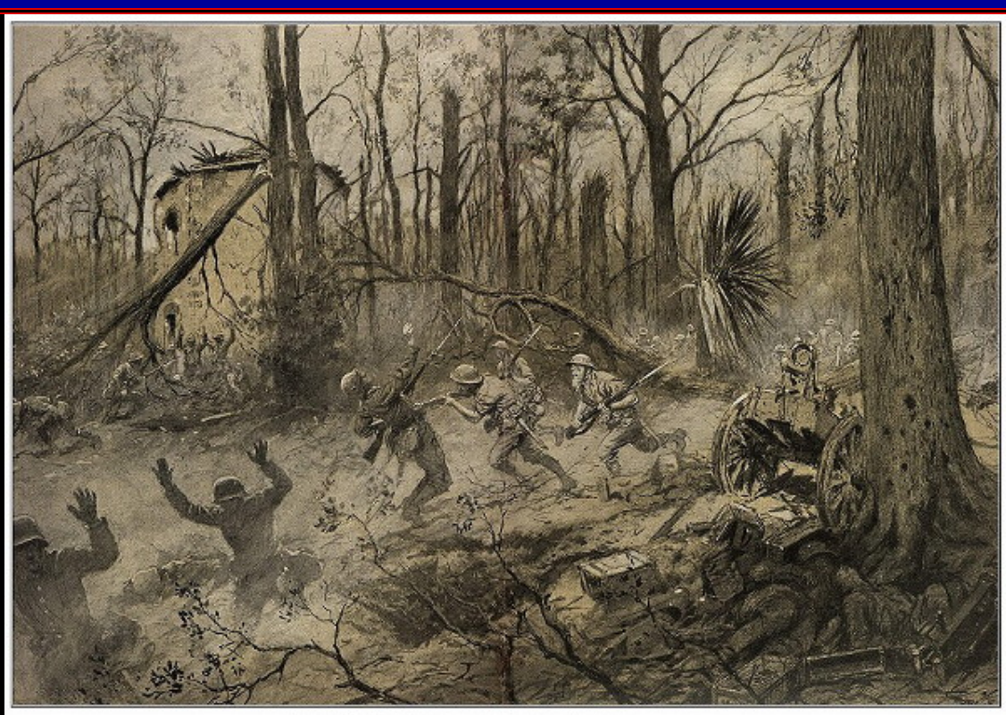
LA BRIGADE MARINE AMERICAINE AU BOIS DE BELLEAU